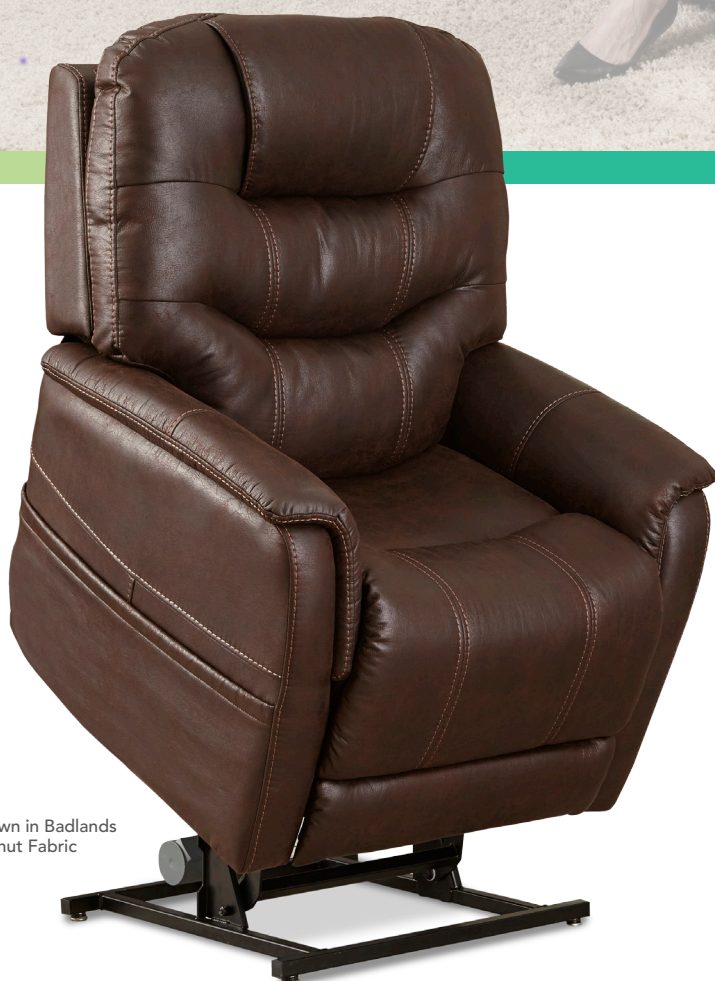
Shown in Badlands Walnut Fabric